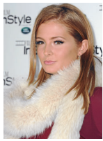
Made in Chelsea star Millie Mackintosh (left) enjoying drinks at the One&Only Royal Mirage

before the strawberry-blonde socialite tweeted that she was struggling to keep up. 'Third night out in Dubai and seriously fading. They know how to party.' After popping into the Mahiki launch, she enjoyed some downtime surfing with Surf Dubai.