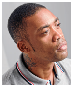
British 'Wearing My Rolex' rapper Wiley (left) wandering around Media City with an impressive

entourage. Aussie professional teen surfer Sally Fitzgibbons catching some waves at Wadi Adventure and hanging with the Surf Dubai crew before snapping pics of the Burj Khalifa from Beach Road.