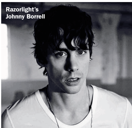
Razorlight's Johnny Borrell