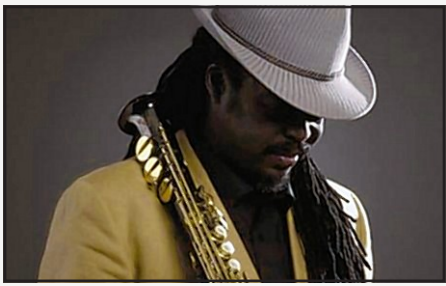
AMBITION: Courtney Pine